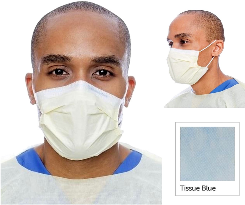
Image shown for reference purposes only. Actual product appearance may